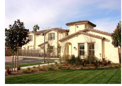
Fountain Walk Opened in 2007