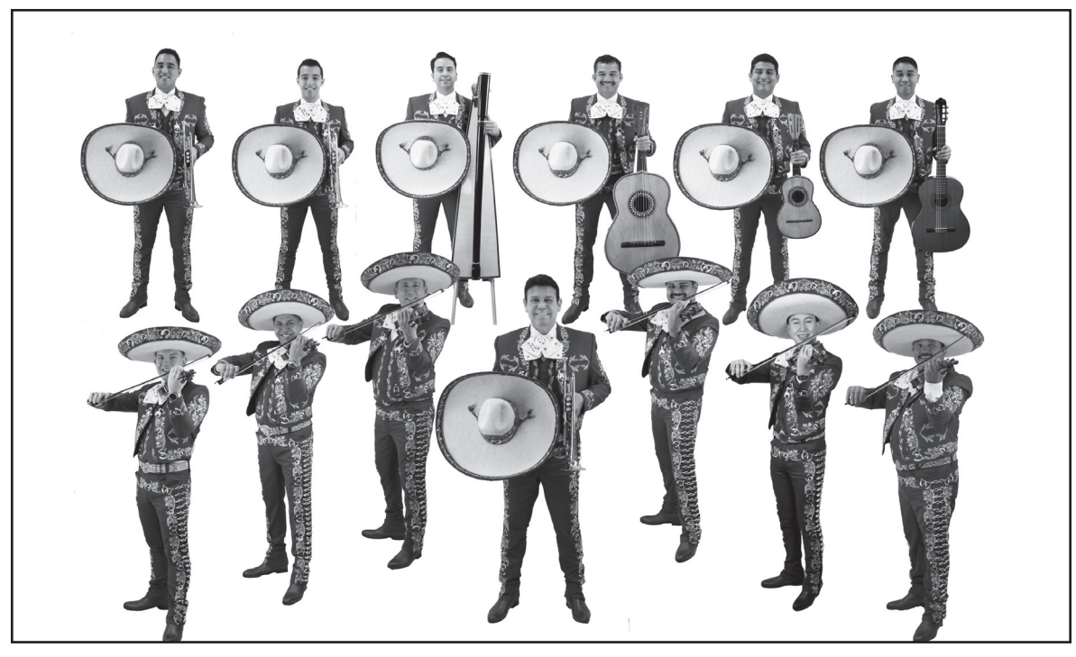
Merry-Achi Christmas returns to the Cerritos Center for the Performing Arts December 6 through December 8.

The Cerritos Center for the Performing Arts (CCPA) gets ready to close out the year with a bang! From R&B to Pop and Jazz and magic and more, check out what's in the December lineup!